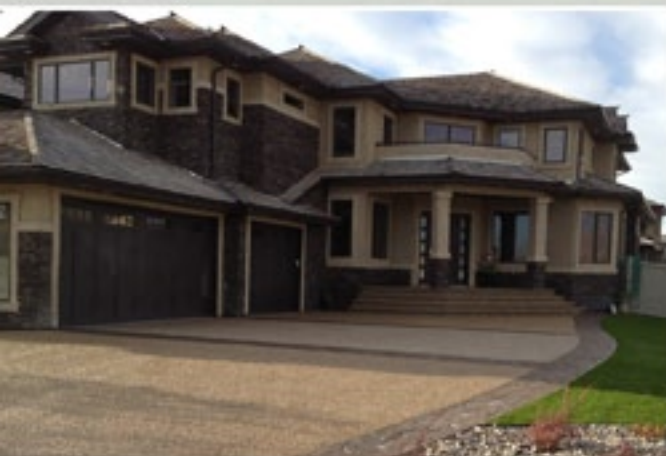
Brown exposed aggregate with stamped borders.