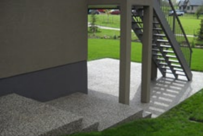
Grey exposed aggregate patio with stairs coming down the side of the house from the back door of the garage.