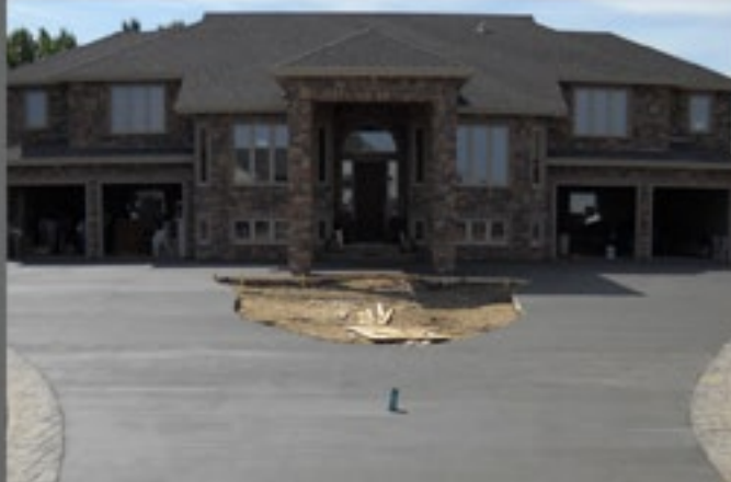
Broom finished driveway with stamped borders.