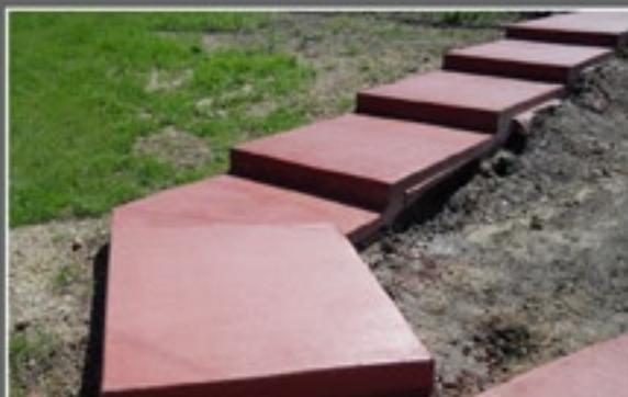
Broomed finish with colour added to concrete.