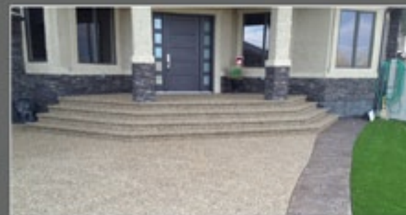
Brown exposed aggregate with stamped borders.