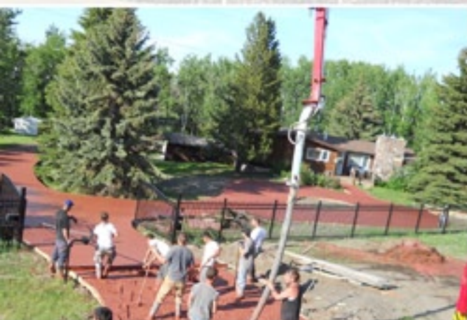
Crew hard at work.