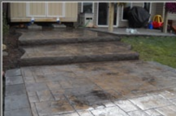
Over 30 years of experience in concrete flat work and decorative concrete.

Whatever your concrete needs, let the experts at Hunter Concrete help you design and achieve your concrete project today.