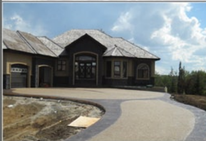
Brown exposed aggregate with stamped borders.