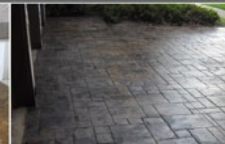
Various stamped concrete projects.