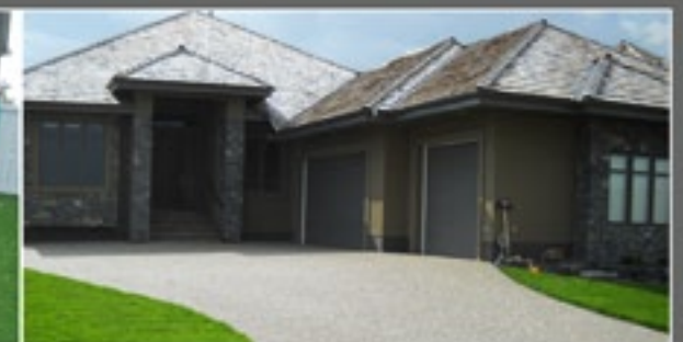
Standard grey exposed aggregate.